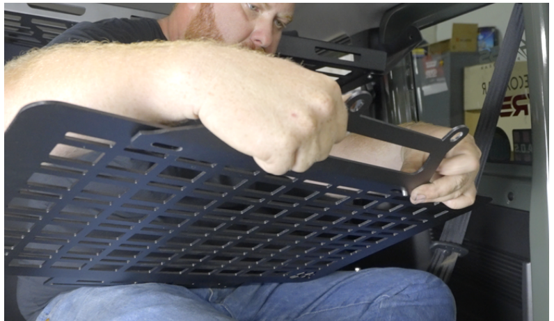
Bracket show here is the non air bag top bracket

Loosely assemble MOLLE handle to MOLLE Panel